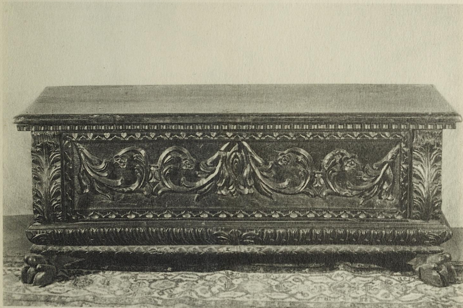
180 Florenz, Mitte 16. Jahrh.