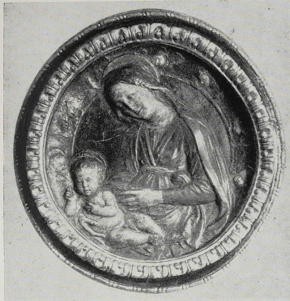
Terracotta-Relief um 1700