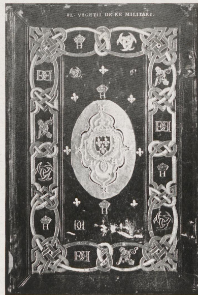
Fig. 6 — Vegetius De re militari , Paris, 1532.