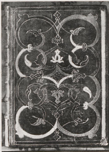
Fig. 5 — Il Dioscoride di A. Maioli, Venezia, 1548.