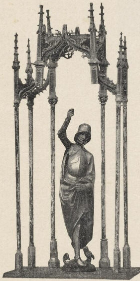
No. 175 u. 159