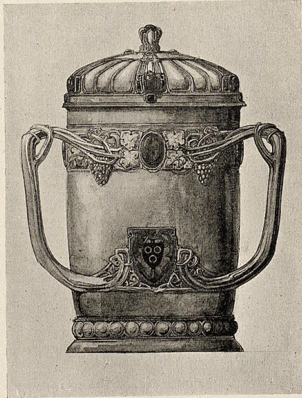
DESIGN FOR A CUP