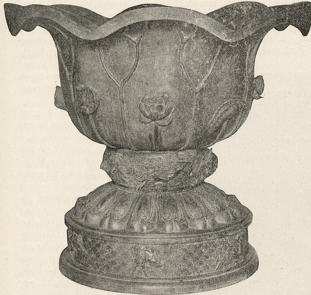
TEMPLE FOUNT AT THE YAMANAKA GALLERIES

the celebrated Portland Vase in the British Museum, and are expressive of the height of Greek art. This collection is of immense rarity and beauty.