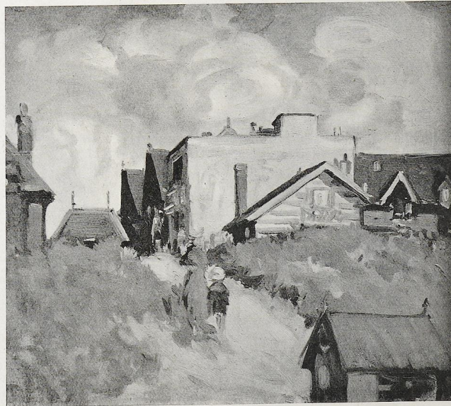
"A CLOUDY DAY, PARIS PLAGE"

Two or three years ago there was shown in