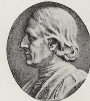
ARCHBISHOP BENSON BY A. BRUCE-JOY