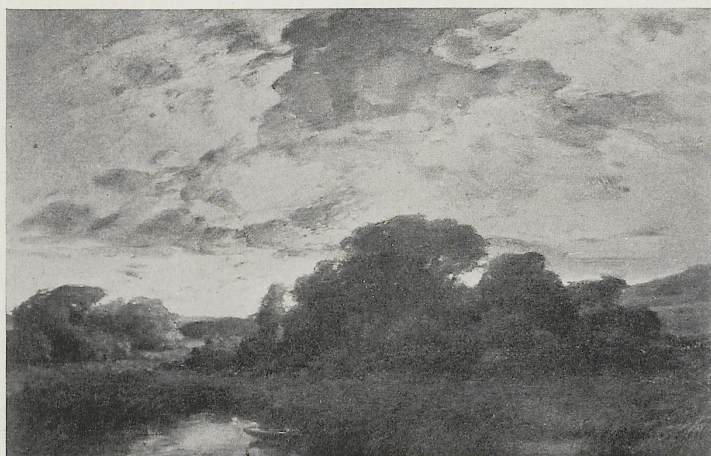
A CALIFORNIA SUNSET

which gives a balance and sense of completeness to his compositions. For instance, in the Yosemite Falls there is seen his truth to nature and mastery of detail worked out into a perfect whole that is satisfying to the eye and filled with poetic suggestion and imagination. In this picture he has marvelously suggested that recognition of an unseen, mysterious power which we all experience in the presence of nature in her grander moods, and has succeeded notably in suggesting the grandeur of nature without falling into the "grand style."