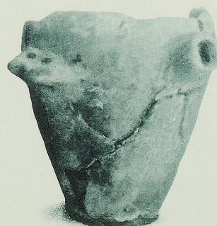
Fig. 4 - (Alt. cm. 21)