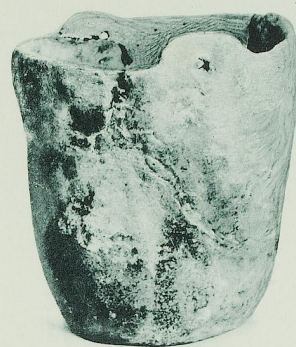
Fig. 2 - (Alt. cm. 11)