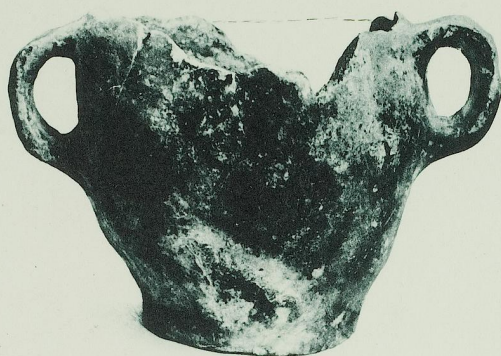
Fig. 1 - (Alt. cm. 18)