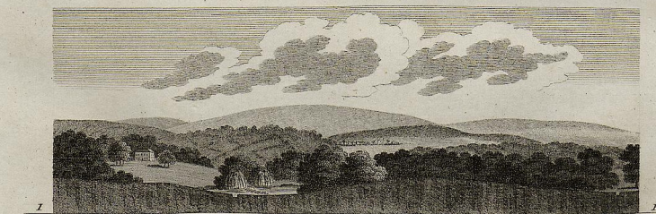
CHALK LODGE, N° 2.

Published by J. & J. Taylor, High Holborn, London, Jan'y 1798.