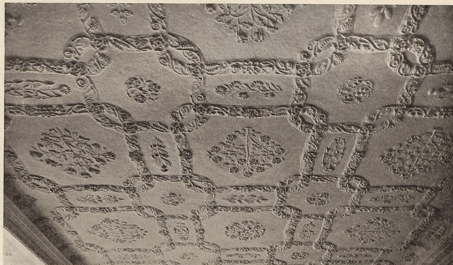
MODELLED PLASTER CEILINGS